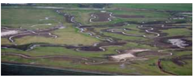
Project area shortly after project completion (2 months after)